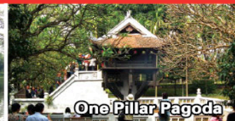
One Pillar Pagoda