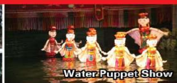
Water Puppet Show