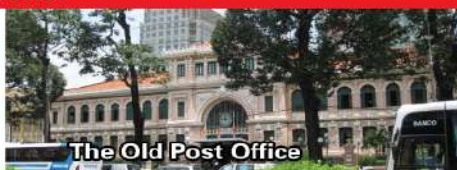
The Old Post Office