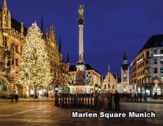
Marien Square Munich