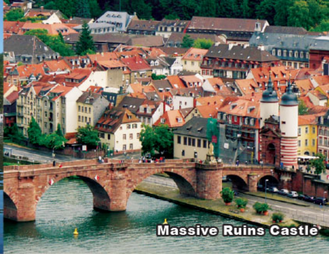
Massive Ruins Castle