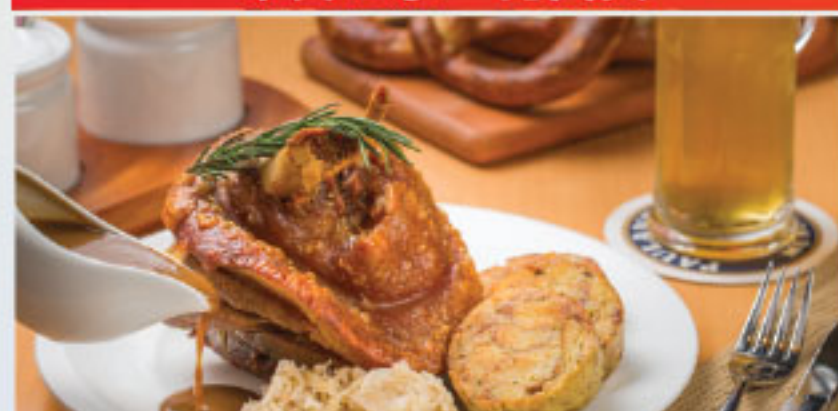
滴滴湖 - 德国烤猪脚