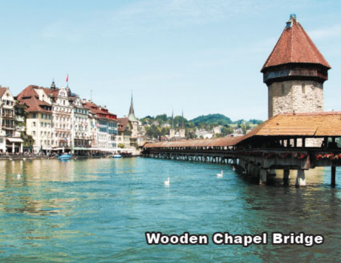
Wooden Chapel Bridge