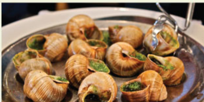
French Cuisine with Escargot