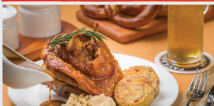
German Lunch with Pork Knuckle