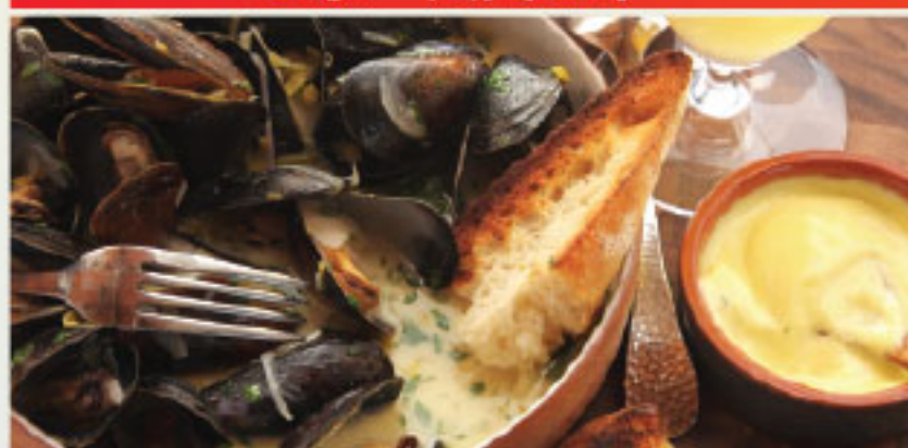
布鲁塞尔 - 青口贝