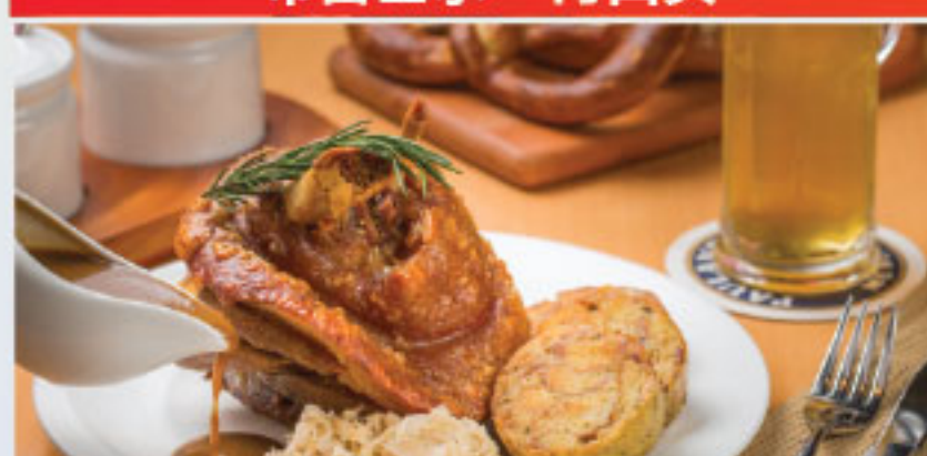
滴滴湖 - 德国烤猪脚