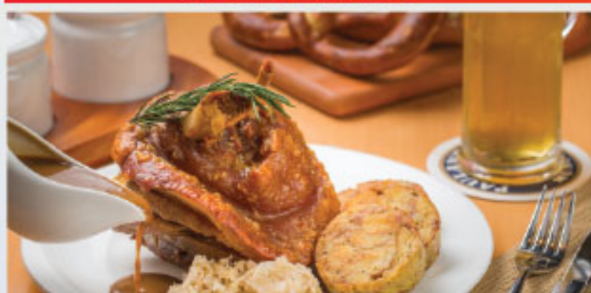
German Lunch with Pork Knuckle