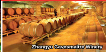
Zhangyu Cavesmaitre Winery