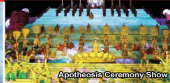
Apotheosis Ceremony Show