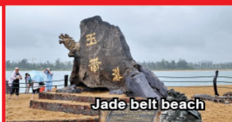
Jade belt beach

Sequences of Itinerary are subject to local arrangement.