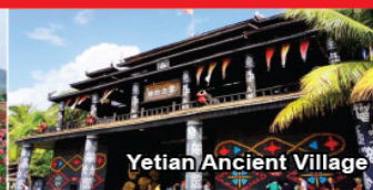
Yetian Ancient Village