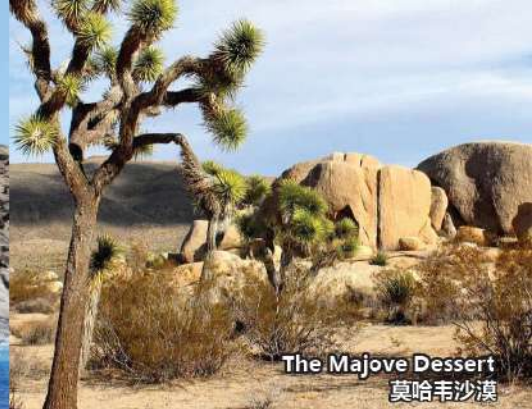
The Mojave Desert 莫哈韦沙漠