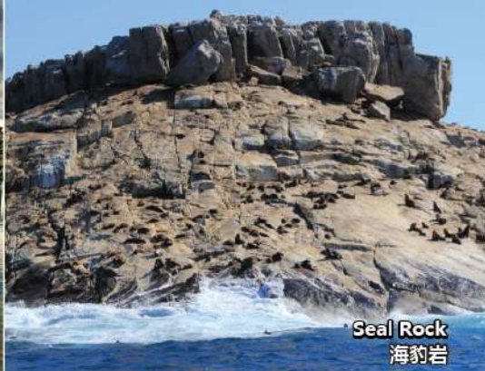
Seal Rock 海豹岩