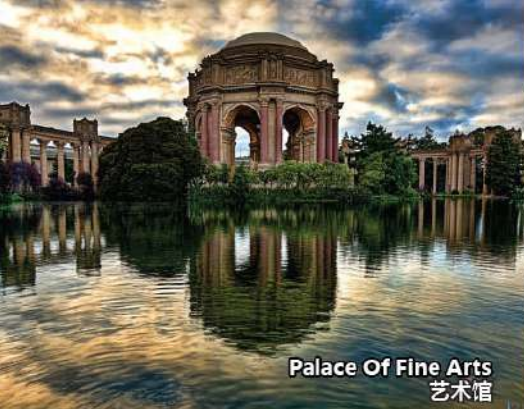
Palace Of Fine Arts 艺术馆