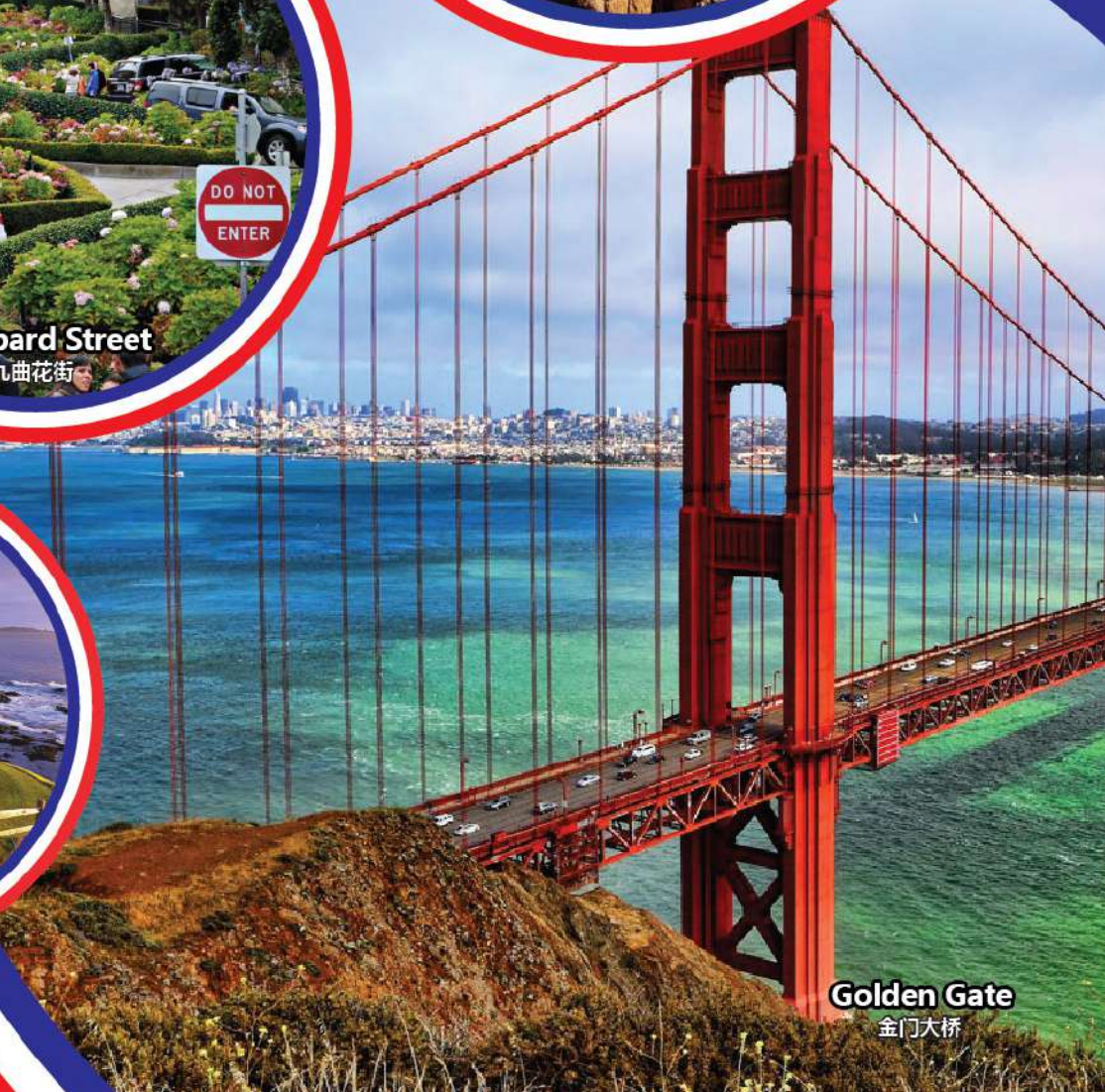
Golden Gate 金门大桥