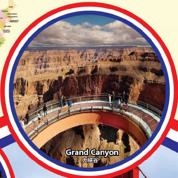
Grand Canyon 大峡谷